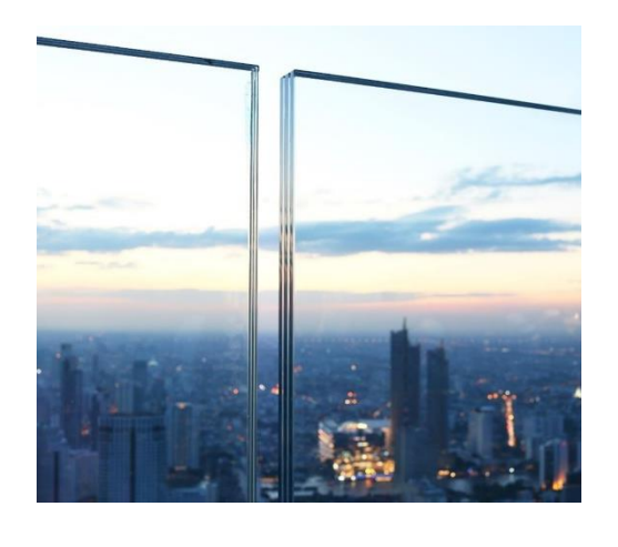
Manufacturer: Saint-Gobain India Pvt. Ltd