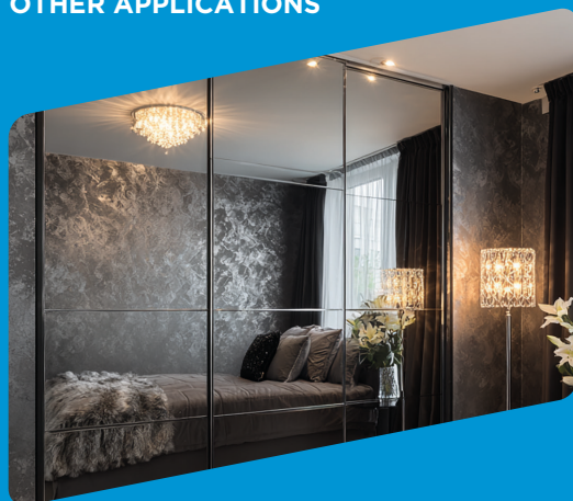
▲ Cupboard doors