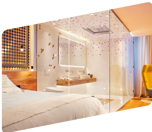
▲ Light more intense in the bathroom than in the bedroom - Espacio GIRA, Guillermo Escobedo - CASA DECOR 2016